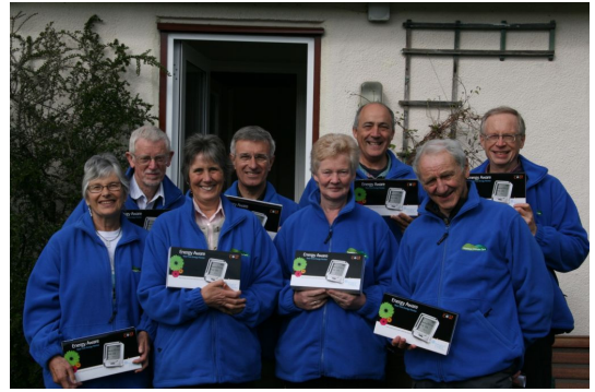
Some of the team with the free smart energy monitors

Our Low Carbon Technology day was a great success and judging by the number of surveys booked by renewable energy installers Llani Solar and Greenearth Energy, they too were more than happy. Following on from the event we have installed over 140 free smart energy monitors in and around the Strettons in a joint project with the Energy Saving Trust. The monitors measure real time electricity consumption and cost. So effective are they in changing energy consumption behaviour we have been able to secure some grant funding to purchase more to loan out. Anyone interested in making savings on their electricity bill should give us a call to arrange the loan of a monitor. A big thank you to all those who helped us hand deliver almost 3,000 mailings from the Energy Saving Trust about the free monitor scheme and the Technology Bazaar.